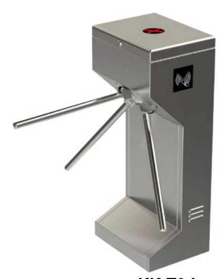
KK-T6-L (Tripod Turnstile)